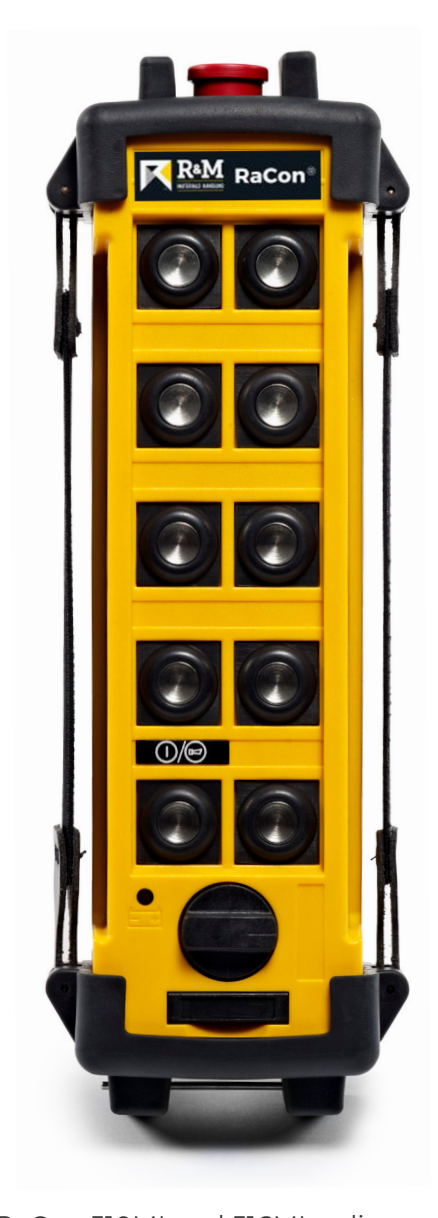
RaCon 510MI and 516MI radio with 2-step momentary buttons