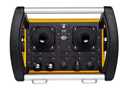
RaCon 736SA radio with two analog joystick controlelrs