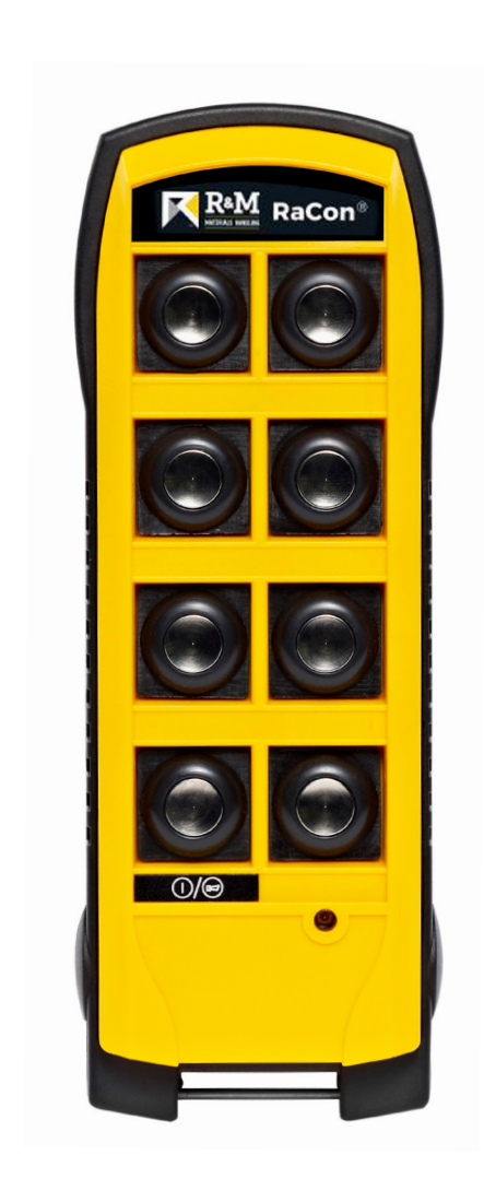
RaCon 510QU and 512QU radio with 2-step momentary buttons

RaCon® radio controls increase efficiency and reduce operating risks, all while allowing the operator to have a good view of the load on the hook and to manually assist, if necessary.