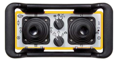
RaCon 512EC and 516EC radio with two mini-joystick controllers