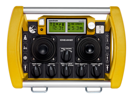
RaCon 516S2 and 524S2 radio with two advanced joysticks and display for HoistMonitor condition monitoring