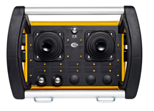
RaCon 512SP, 516SP, 524SP, and 736SP radios with two advanced joystick controllers.