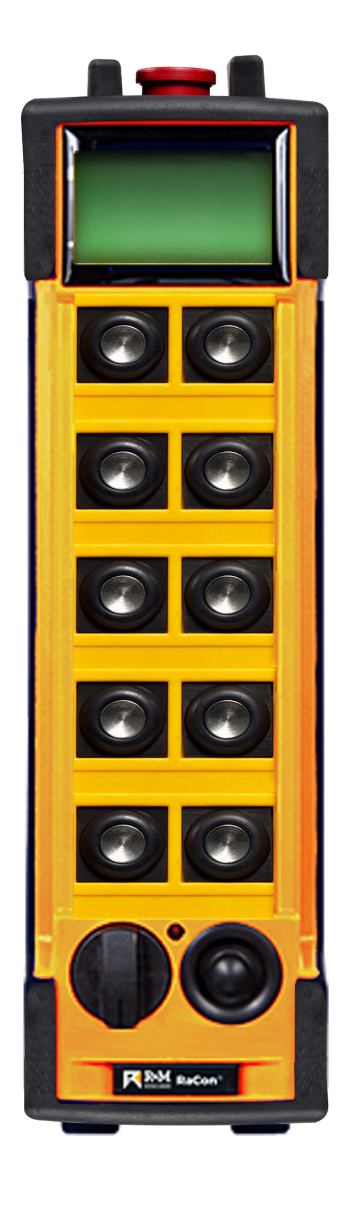
RaCon 516M3 radio with 2-step momentary buttons and display for HoistMonitor® Condition Monitoring